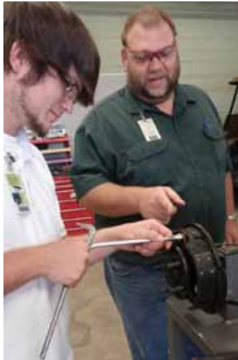
The Lafourche Parish School District purchased a hydraulic brake system to train high school automotive students and help them be job-ready.