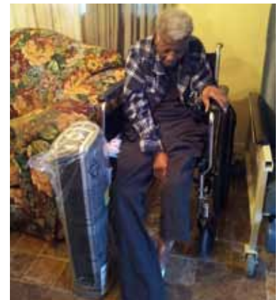
With a 2014 grant from BCF, the Terrebonne Council of Aging distributed 86 personal heaters to needy elderly.

We invite you to be a part of this exciting philanthropic story with a new or continued gift to BCF. Thank you for helping us grow and strengthen our community!