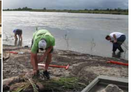
BTNEP used their grant to purchase a boat to transport volunteers and plants to shallow coastal marshes for restoration projects.